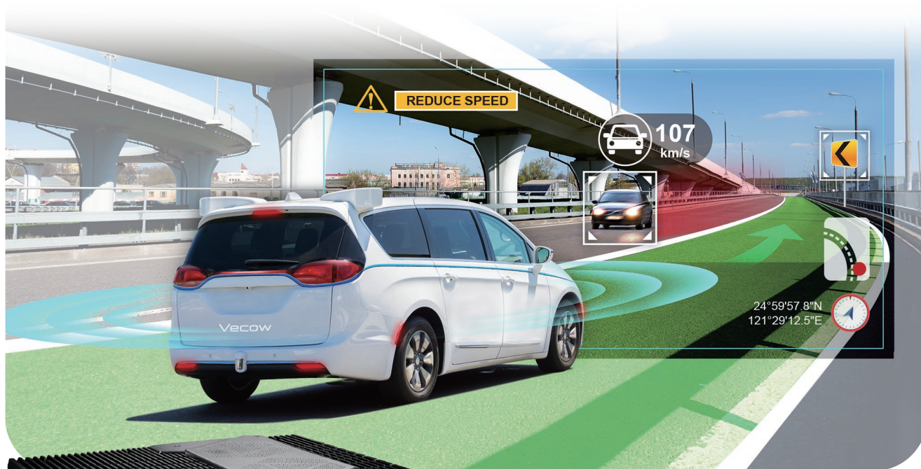
▲ Traffic Vision

AI Computing System with NVIDIA® Tesla®/Quadro®/GeForce® Graphics