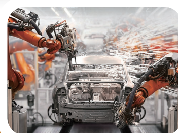
▲ Robotic Control