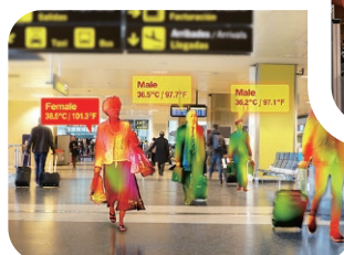
▼ Public Surveillance